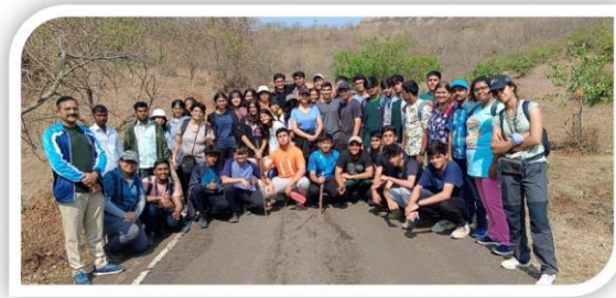
18 - DP1: ESS Field Trip

For nearly two months, the student-led team has worked hard to make both competitions a success, providing participants with imaginative prompts and giving them a platform to unlock their creative potential.