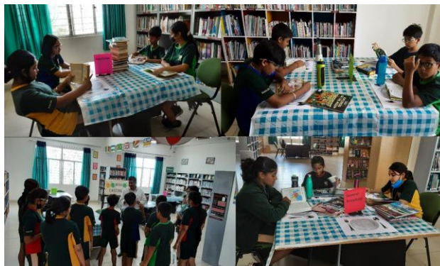
6 - MYP Reading Day

Students of MYP 1-3 enjoyed a refreshing break from academics when they visited the library for a while to briefly spend time with themselves and selected books. Although World Reading Day is celebrated on 23rd April, since it fell on a Sunday this year, students enjoyed a delayed Reading Day.