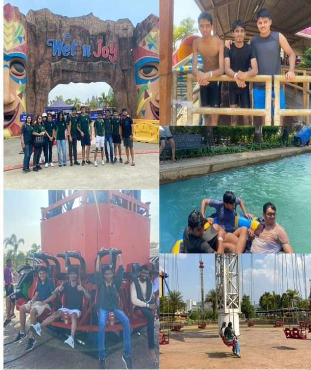
25 - Wet' N Joy Water Park

The students were also taken to Wet' N Joy Water Park in Pune for a day of fun and relaxation. It was a well-deserved break from their studies and routine. The water park provided a refreshing escape from the summer heat and offered a variety of rides and attractions to suit everyone's tastes. The students enjoyed their day to the fullest and returned to their boarding house with renewed energy and enthusiasm for their studies. Overall, it was a great way for the borders to unwind and create lasting memories with their friends.