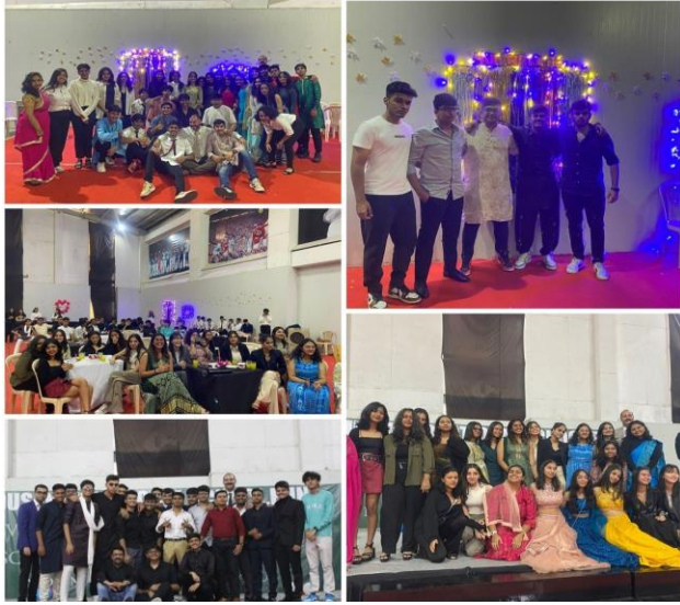
27 - DP 2 Boarding Farewell