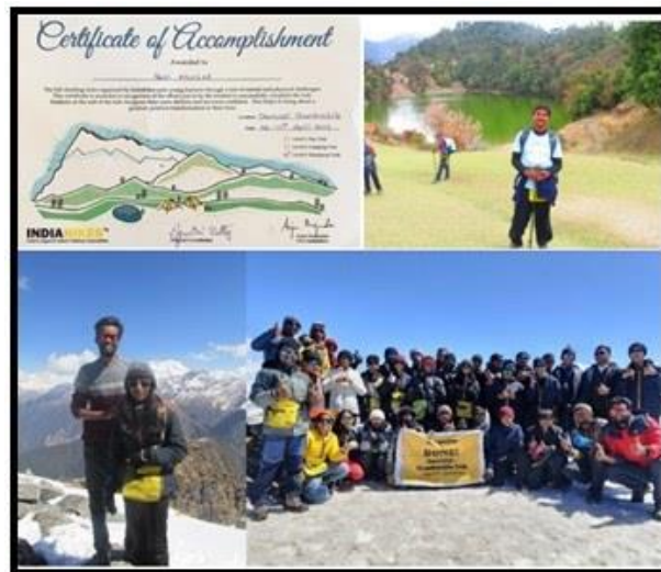
12 - Level 3 Himalayan Trek at Deoriatal - Chandrashila (Uttarakhand)