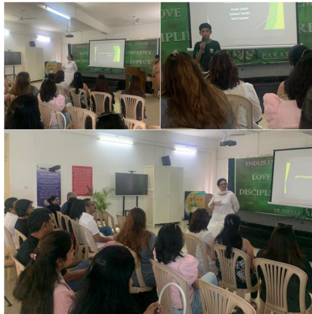
4 - PYP 5 – MYP Parent Orientation

garden using resources found in the school campus. Our PYP 4 children set themselves into the exciting project of growing a herb garden keeping in mind the health benefits of consuming various herbs to ensure a healthy life-style. Last but not the least, our PYP 5 students put up a stall where the recycled artefacts created by students of PYP 3 - 5 were put on sale. We are happy to share that we collected Rs. 10,130 through this artefact sale which will be devoted towards the development of the Biodiverse Garden. Overall, the Earth Day celebration at school benefitted all the students, for it instilled in them the importance of preservation of environment and their responsibility towards the planet.