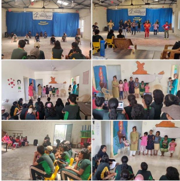
5 - PYP 5 Field Trips and Guest lectures

As the PYP 5 students explore their unit for the PYP Exhibition under the umbrella of the sustainable development goals, all groups have been attending expert talks from nutritionists, educators, environmentalists, and researchers. These expert talks have been organised for specific groups to aid their inquiry. Field trips for the same to boarding schools for challenged students, fitness studios, plastic recycling units, the Angrewadi school were also organised over this month for real life learning. This experiential learning component for the PYP Exhibition is sure to propel their inquiries forward as they prepare for their final Exhibition Day.