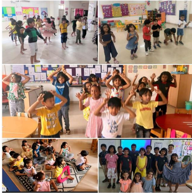
1 - Mufti Day

To celebrate the spirit of change and rejuvenation the PYP students celebrated Mufti Day on 10th April as they came back from their Spring break. Children dressed up in colours of Spring and were engaged in activities in class which highlighted the spirit of the season.