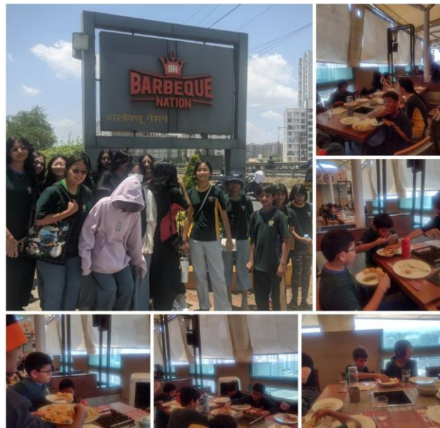
32 - Barbeque Nation

On April 29, boarding students were escorted on a hike to Parvati Hills to view the sunrise. Parvati Hills in Pune is a renowned tourist destination as well as a significant landmark. To get there, the students have a short hike and arrived well in time to witness the spectacular sunrise. There was a small temple on the hill, where some students and staff offered their prayers. A few students visited the museum to learn about the history of Pune. While trekking down the hill, they passed by a park and to unwind and converse with their friends. Waking up early and trekking in the fresh morning air to view the sunrise was a unique experience for many of our students.