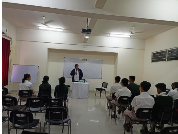
20 - US University Fair

We look forward to continuing the series of Career Talk by inviting more parents from various industries to come and share their journeys with Indus Eagles.