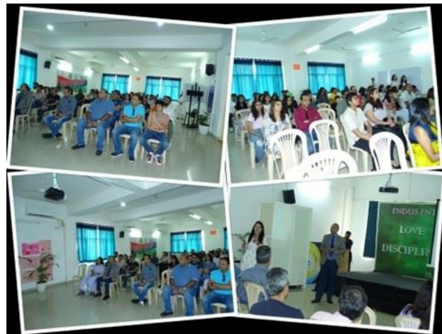
21 - Pre-IBDP Sessions for New Admits

Some of the universities where our students will be pursuing a summer program are Brown University, Harvard University, Babson College, Columbia university, New York School of Interior Design, College for Creative Studies Detroit, University of British Columbia Canada, IED University Madrid, Plaksha University, Atria University and many more.