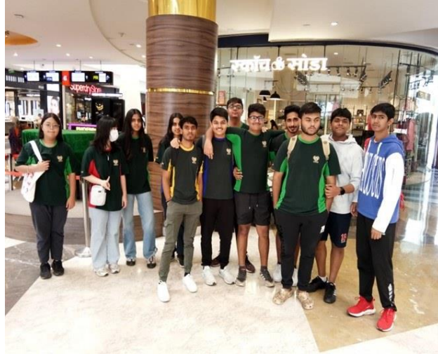
24 - Spring Break

From the 1st to 8th of April various activities along with studies were organised for the few boarding students who stayed back during Spring break. The students were taken to Phoenix Mall in Pune for a day of fun and entertainment. They were excited to spend time together outside of their usual school routine and explore the various stores and attractions of the mall. They spent hours shopping, trying out new foods, and challenging each other in the arcade games section. The trip was a great way for the students to bond and create lasting memories together, and they returned to school feeling refreshed and energised for the rest of the semester.