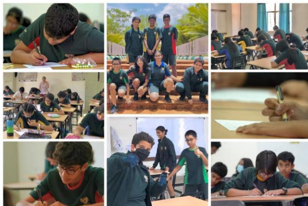
17 - Creative Competitions

The second session, conducted by the dean of the School of Design at FLAME, was also eye-opening. The speaker showed videos about two major projects of the school which incorporated design and idea generation in novel ways in order to create solutions for 21st century problems, including innovative designs for elevators, and a new design which could help blind children in schools learn Braille, and improve their communication.