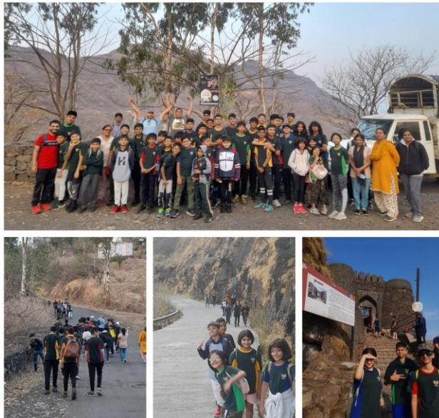
26 - Sinhagad Fort Trek

The students were also taken to Wet' N Joy Water Park in Pune for a day of fun and relaxation. It was a well-deserved break from their studies and routine. The water park provided a refreshing escape from the summer heat and offered a variety of rides and attractions to suit everyone's tastes. The students enjoyed their day to the fullest and returned to their boarding house with renewed energy and enthusiasm for their studies. Overall, it was a great way for the borders to unwind and create lasting memories with their friends.