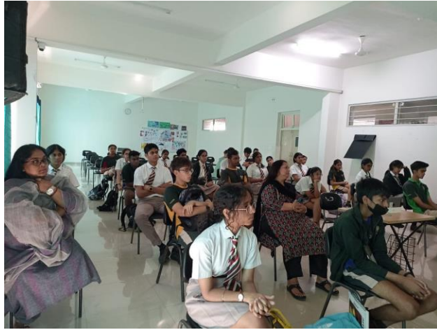
19 - Career Talk