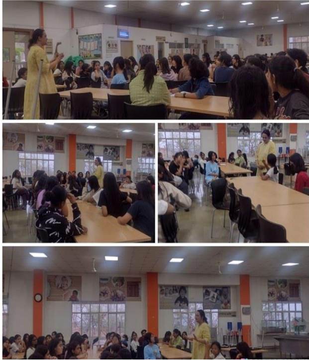
29 - Health and Hygiene Workshop for Girl Boarders