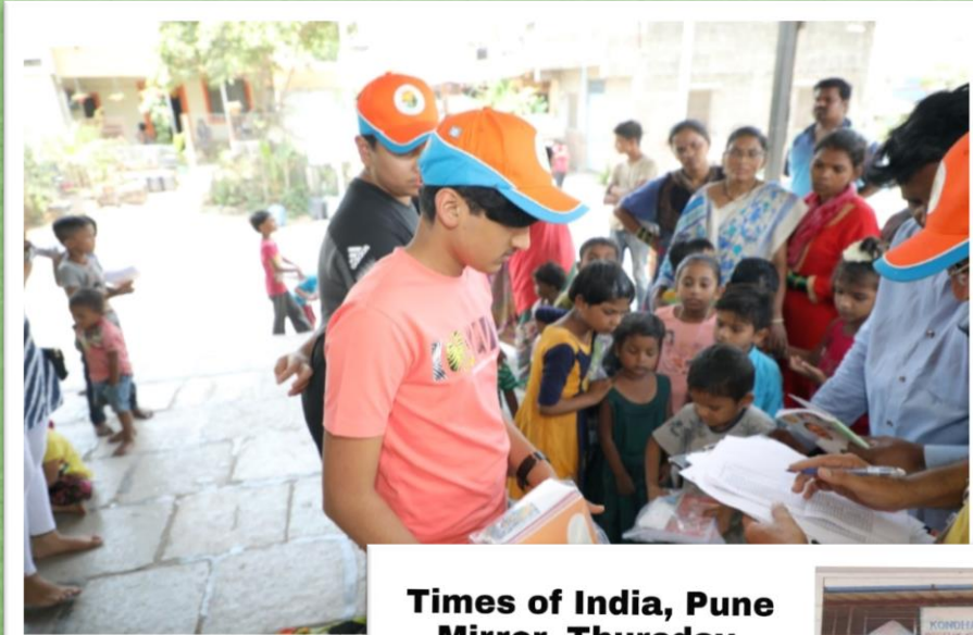
Times of India, Pune Mirror, Thursday, June 9, 2022, Page 7...