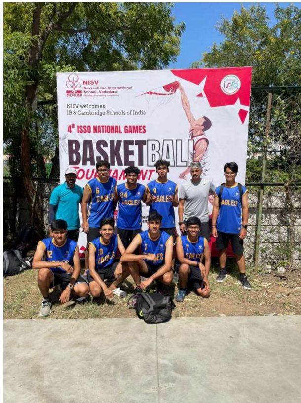
28 - Basketball: Under-19 and Under-17 Boys teams participated.