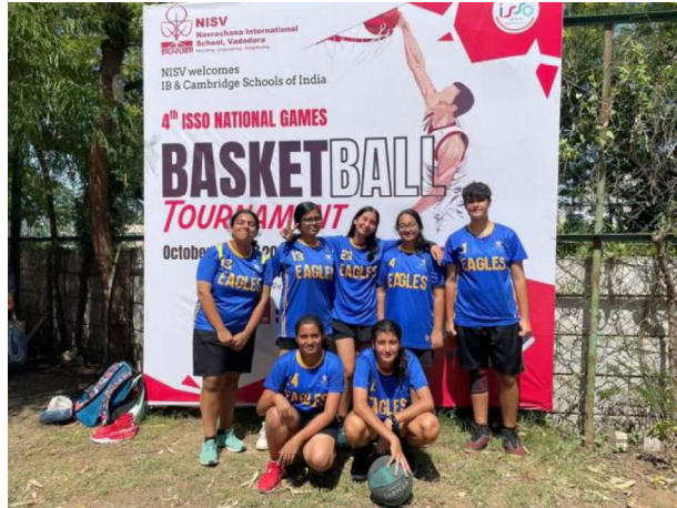
27 - Basketball: Under-19 Girls teams participated.