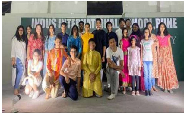
33 - Indus International School Pune organized a plethora of activities over the past month to ensure that the students are kept engaged and enjoy their time in boarding. Students celebrating the tradition of Gujarat. All of them wearing traditional clothes for Garba and having fun and dancing their hearts out.