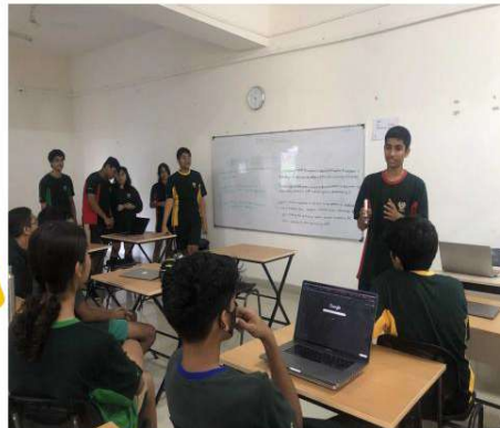
9 - MYP Year 5 students participated in several debates as they explored their first Interdisciplinary Unit (IDU) connecting English Language & Literature to the Sciences using Healthcare as the subject.

Passionate dialogues highlighted the empathy and economist mindsets of our Eagles, making for thought-provoking idea generation.