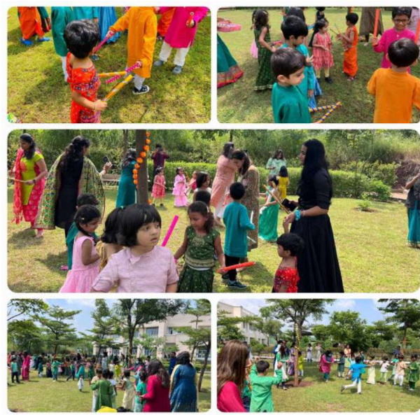
2 - Dussehra Celebration