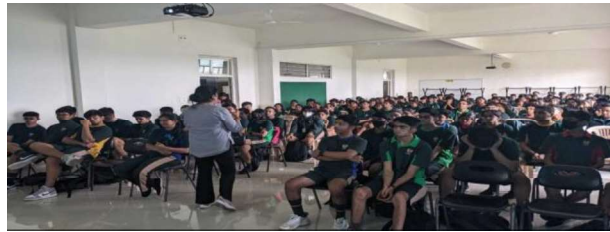
11 - Intermediate and Senior Category Orientations for the upcoming I Lead Cup.