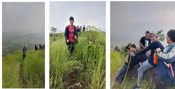
Exploring the wonders of nature through trekking