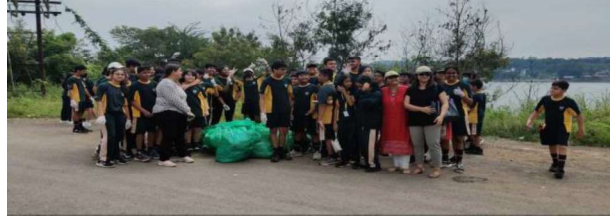
10 - Students of MYP Years 1-3 set out for a day of Community Service where they cleaned up the areas surrounding Manas Lake. They worked with much enthusiasm and collected a lot of trash, thus leaving the environment much cleaner. They came back with pride and excitement, narrating stories of their adventures.