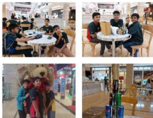
35 - Friendship is an important aspect of life, which is required in every part and adventure of life to explore different things. A trip like a mall outing helps in strengthening friendships and making memorable moments, which we will look back too in the future to see how times have changed.