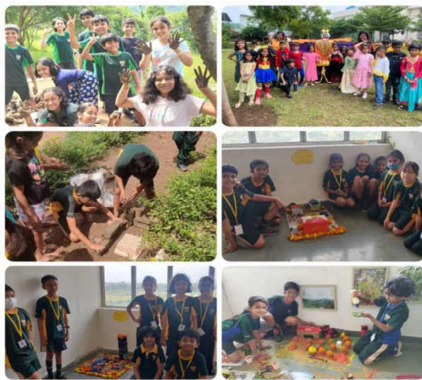
6 - Inter-house Cultural Festival

5 - Students of PYP 4 celebrated their learning of the transdisciplinary theme 'How we express ourselves' through an artistic presentation to parents and teachers. They displayed their understanding of various forms of visual and performing arts and understood the role they play in society. The learning from the unit was evident as students reflected on the concepts of aesthetic, culture and traditions.