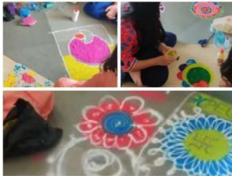
12 - Rangoli -Making Competition at 'UBUNTU' (Cultural Fest).