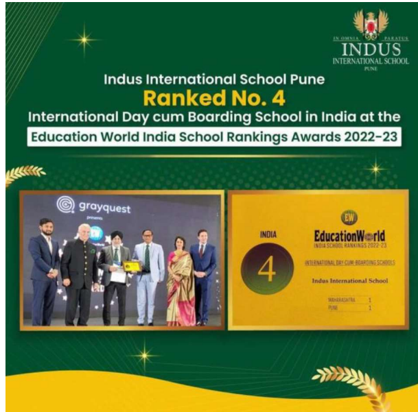
1 - Indus International School Pune Ranked No.4 in India.