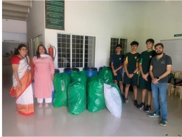
11 - Second milestone for plastic Warriors