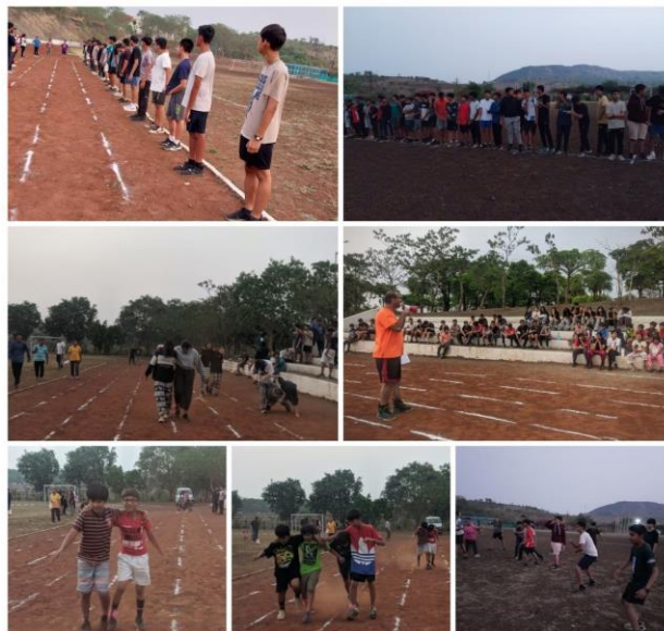
20 - Crazy Olympics