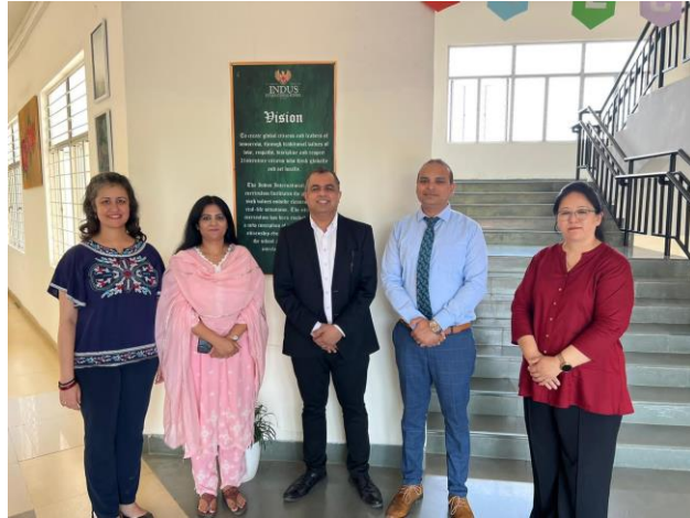
19 - Summer Engagements