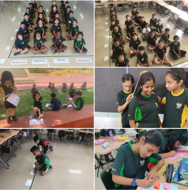
1 - Math Day