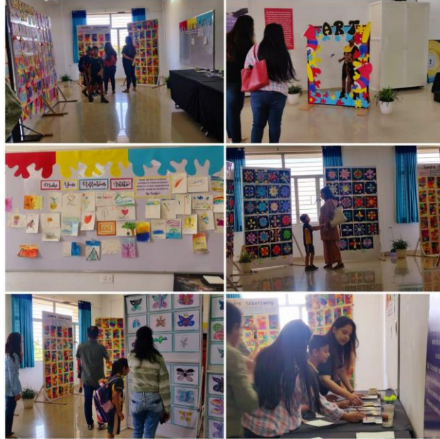
6 - PYP Art Carnival