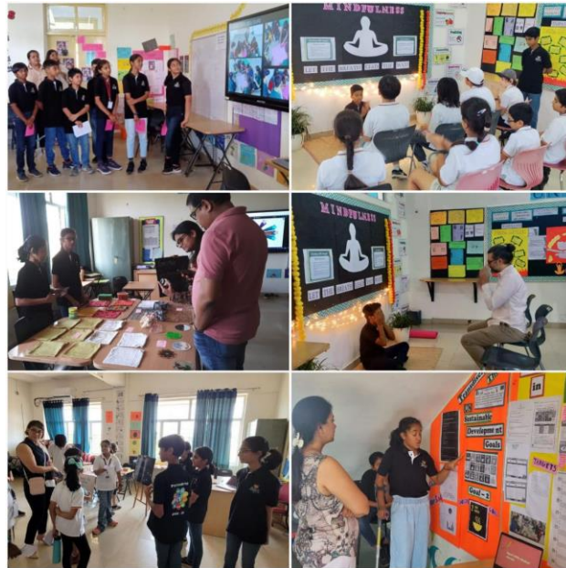
2 - PYP 5 Exhibition

In the PYP, for Math Day students were provided an opportunity to learn about famous mathematicians and their contributions, participate in interactive math activities, and develop a love for numbers and problem-solving. Math Day created a positive learning environment for students, where they could build confidence about their math abilities and see the real-world applications of math concepts. Each grade was given different math strands and activities were planned around the same. EYP- PYP 1 covered the strand of Shapes where they sorted and classified objects based on their shapes, made shape collages, and created patterns using shapes. PYP 2 used the strand of patterns and looked for the same in nature and illustrated them. PYP 3 delved into Data Handling and created a visual representation of the bar graph using themselves, where they organised themselves according to the four house colours and stood on a life size grid. PYP 4 showcased the strand of Measurements by playing a game on measurements- Scavenger hunt- looking for objects of different heights and measuring using tools of measurement. Finally, PYP 5 conducted an activity called 'Figure Me Out' where, in groups of 2 they used their knowledge about BODMAS to create and solve algebraic equations that would uncover a secret number to find answers to each other's questions or riddles. Overall, Math Day was a fun and engaging way for students to develop their mathematical skills and knowledge.