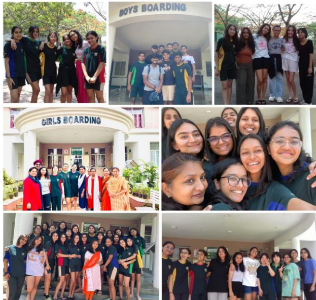
24 - MYP-5 and IBDP-2 Students Depart from Boarding