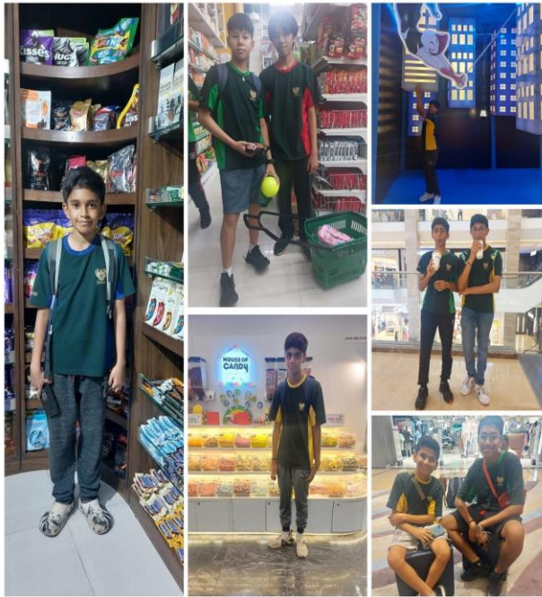
22 - Mall Outing