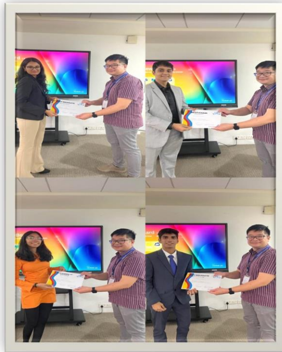
18 - MUN at Mahindra International School

The Model United Nations (MUN) conference, held recently at Mahindra International School, brought together a group of delegates representing various countries to deliberate on complex and critical global issues. The conference was centered around topics such as terrorism, threats to international peace and security, and the situation in Palestine, which are multifaceted and require nuanced approaches.