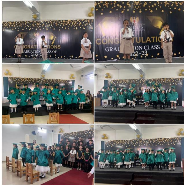
3 - EYP Graduation Day