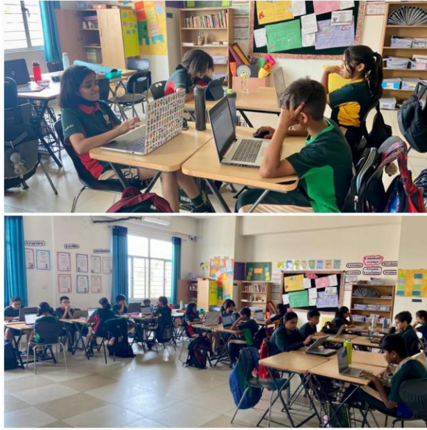
2 - IBT ACER Exam – PYP 3 - PYP 5

The IBT ACER exam for PYP 3 – PYP 5 was held over 4 days, this month. Students appeared for the online exam from school. ACER is an international benchmark test that assesses a student’s overall conceptual clarity and understanding. This year, the students appeared for the online exam in the presence of their homeroom teachers to ensure a principled approach towards the exam and clarity while attempting the same. The results for the same have been shared with parents to understand the overall performance of their child.