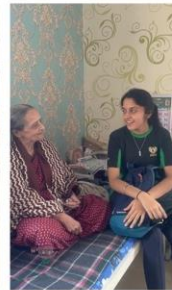
18 - House wise initiatives for CAS