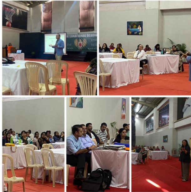
22 - Workshop on Letters of Recommendation

The workshop was an interactive one and concluded with a question-and-answer session.