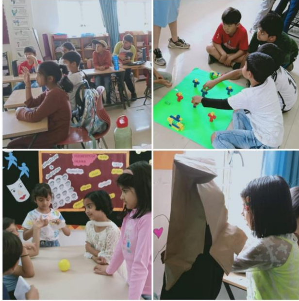
8 - Game-a-thon