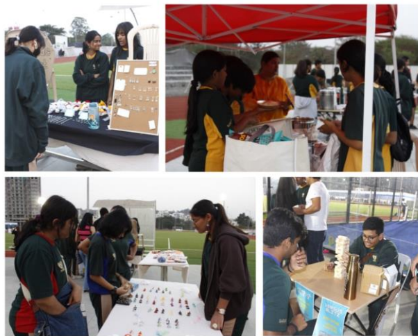
19 - Fete-e-Fete on Sports Day

Pegasus house went to 'Sahjeevan' old age home as a part of "Old is gold" initiative. They believe that there are lots of benefits of intergenerational relationship . Knowledge and understanding of ethnic heritage, sharing of wisdom can help to reduce loneliness and depression in the elderly and an opportunity to learn new skills for both.