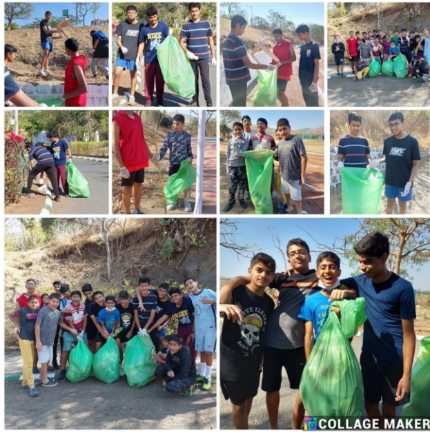
25 - Campus Cleaning

Maintaining cleanliness is an essential part of living a healthy lifestyle. It educates our future leaders to make their environment better and creates a good example for all to follow.