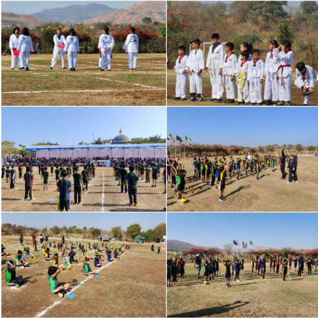
1 - Sports Day