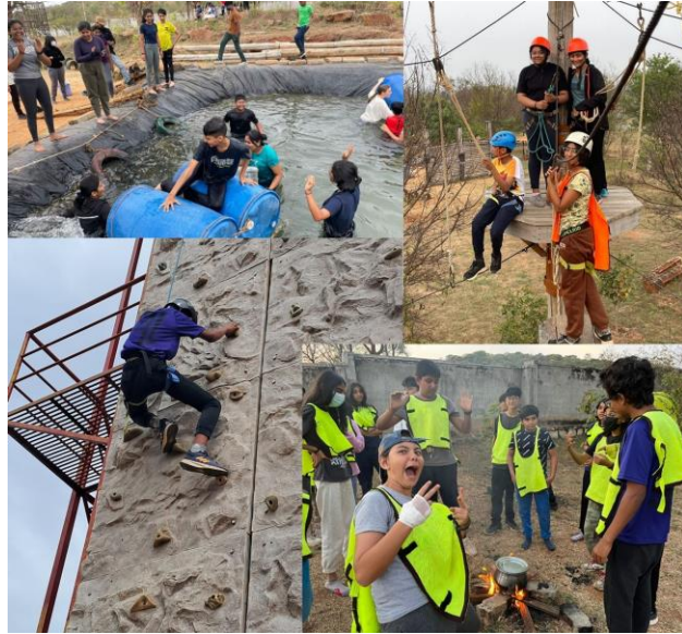
9 - MYP 2 & MYP 3 ISL Camp

A mixed batch of MYP 2 and 3 students went for their ISL camp in Bangalore between 31st Jan and 4th Feb. It was a first time experience for most of them as they both stayed away from home and also engaged in the activities that makes ISL a memorable and joyous experience. They came back with a wide variety of stories and experiences, already looking forward to their trip next year.