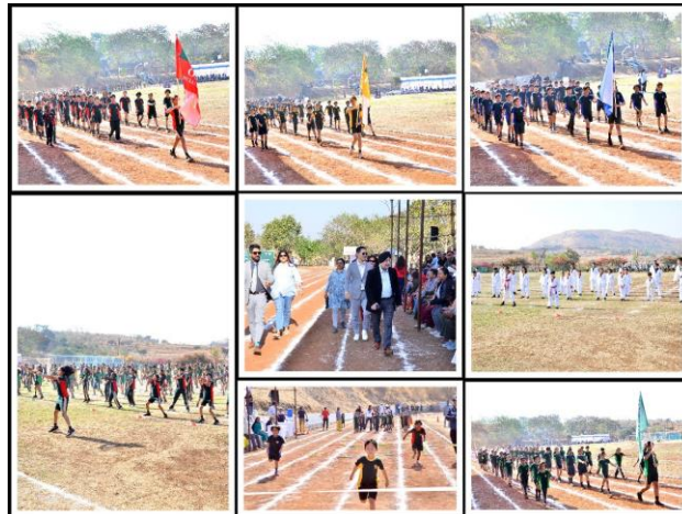
23 - PYP ANNUAL SPORTS DAY