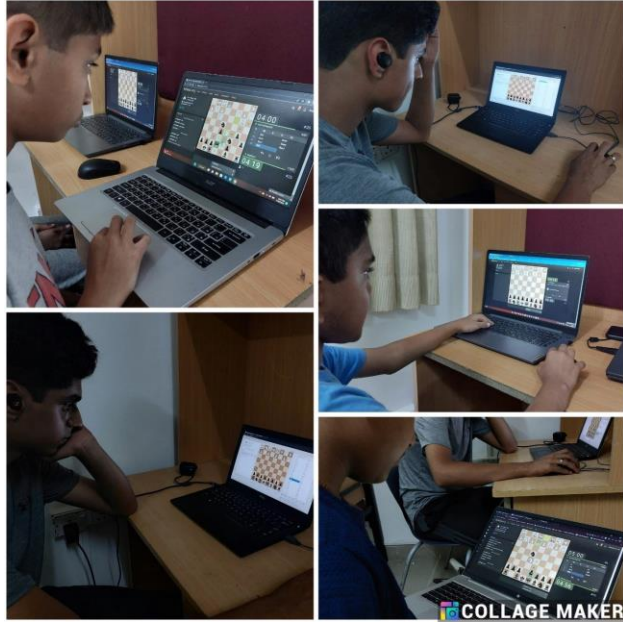
27 - Chess

Chess is a game that trains players to make quick decisions and deal with challenging situations. Students learn how to lose and triumph with dignity and respect. Chess teaches players to take risks and plan strategically, providing them with valuable tools for everyday life. The children enjoyed playing chess and flexing their grey cells.