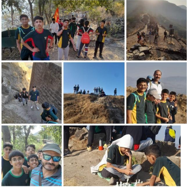
30 - Tikona Fort Trek