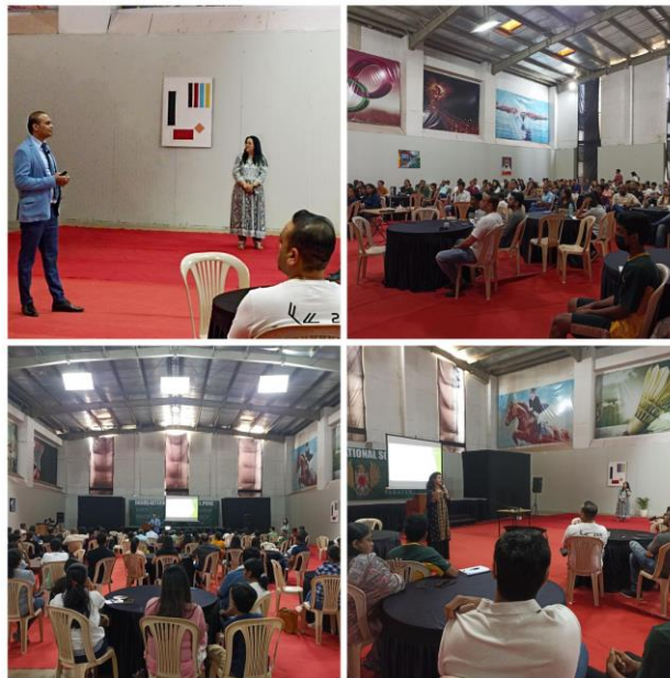
21 - Workshop for Grades 8 and Grade 9 Students & Parents

It has rightly been said that the guidance of parents and career counselors, can perfectly support a child in the most crucial life-changing years of school. It is then imperative that these two pillars meet and understand what's best for their wards.