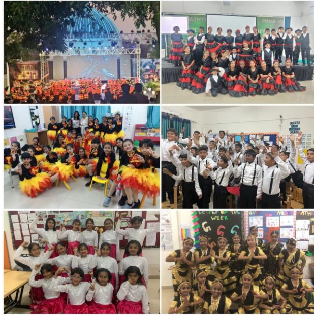
5 - PYP Indus Day