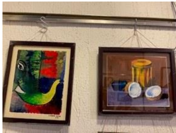
10 - Vihaan Mohan MYP 2 -Art Exhibition

A mixed batch of MYP 2 and 3 students went for their ISL camp in Bangalore between 31st Jan and 4th Feb. It was a first time experience for most of them as they both stayed away from home and also engaged in the activities that makes ISL a memorable and joyous experience. They came back with a wide variety of stories and experiences, already looking forward to their trip next year.