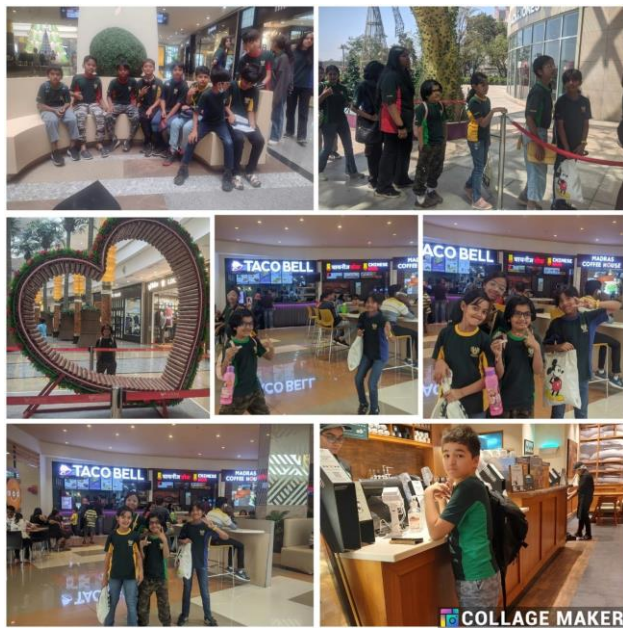
26 - Mall outing

Maintaining cleanliness is an essential part of living a healthy lifestyle. It educates our future leaders to make their environment better and creates a good example for all to follow.