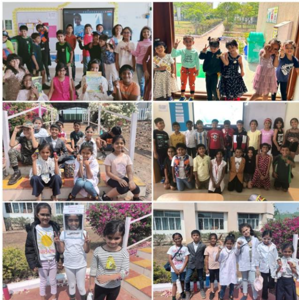
7 - Mufti Day