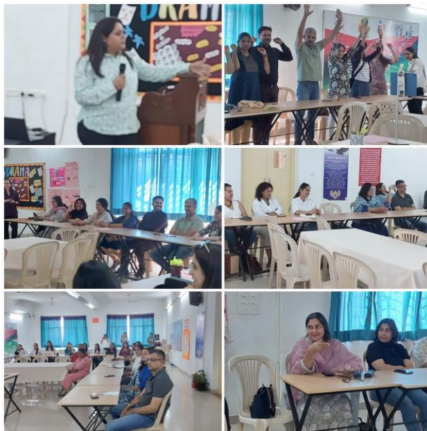
3 - Counsellor’s workshop

The IBT ACER exam for PYP 3 – PYP 5 was held over 4 days, this month. Students appeared for the online exam from school. ACER is an international benchmark test that assesses a student’s overall conceptual clarity and understanding. This year, the students appeared for the online exam in the presence of their homeroom teachers to ensure a principled approach towards the exam and clarity while attempting the same. The results for the same have been shared with parents to understand the overall performance of their child.