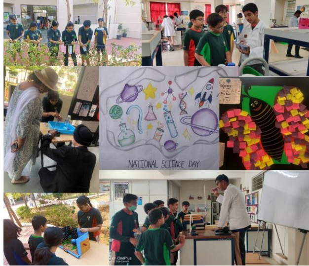
12 - National Science Day Celebration