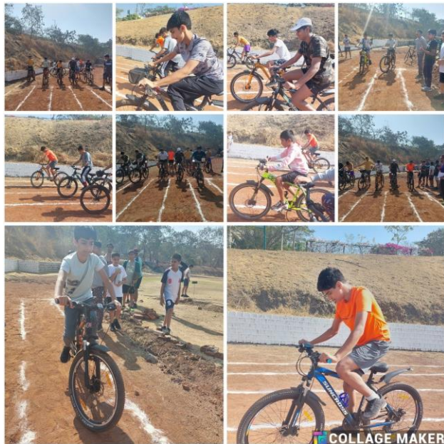
28 - Country Games

Chess is a game that trains players to make quick decisions and deal with challenging situations. Students learn how to lose and triumph with dignity and respect. Chess teaches players to take risks and plan strategically, providing them with valuable tools for everyday life. The children enjoyed playing chess and flexing their grey cells.