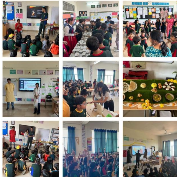
17 - Celebration of PYP Mother's Tongue Day

We hope to visit that place, meet all those wonderful people.....AGAIN!